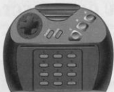
THE JAGUAR CONTROL PAD